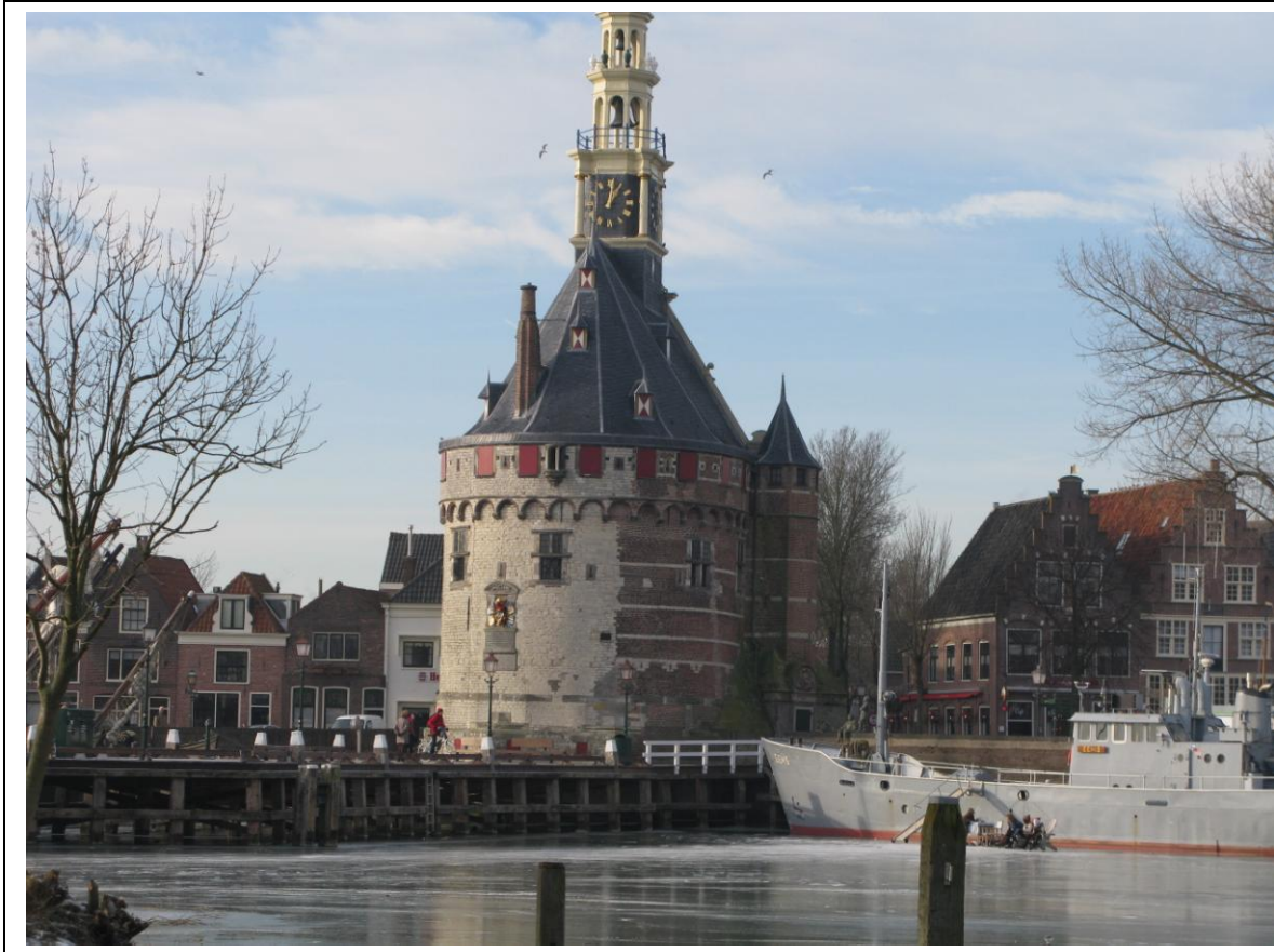
View from our harbour, when the sailors go to the sailing area they pass this beautiful tower.